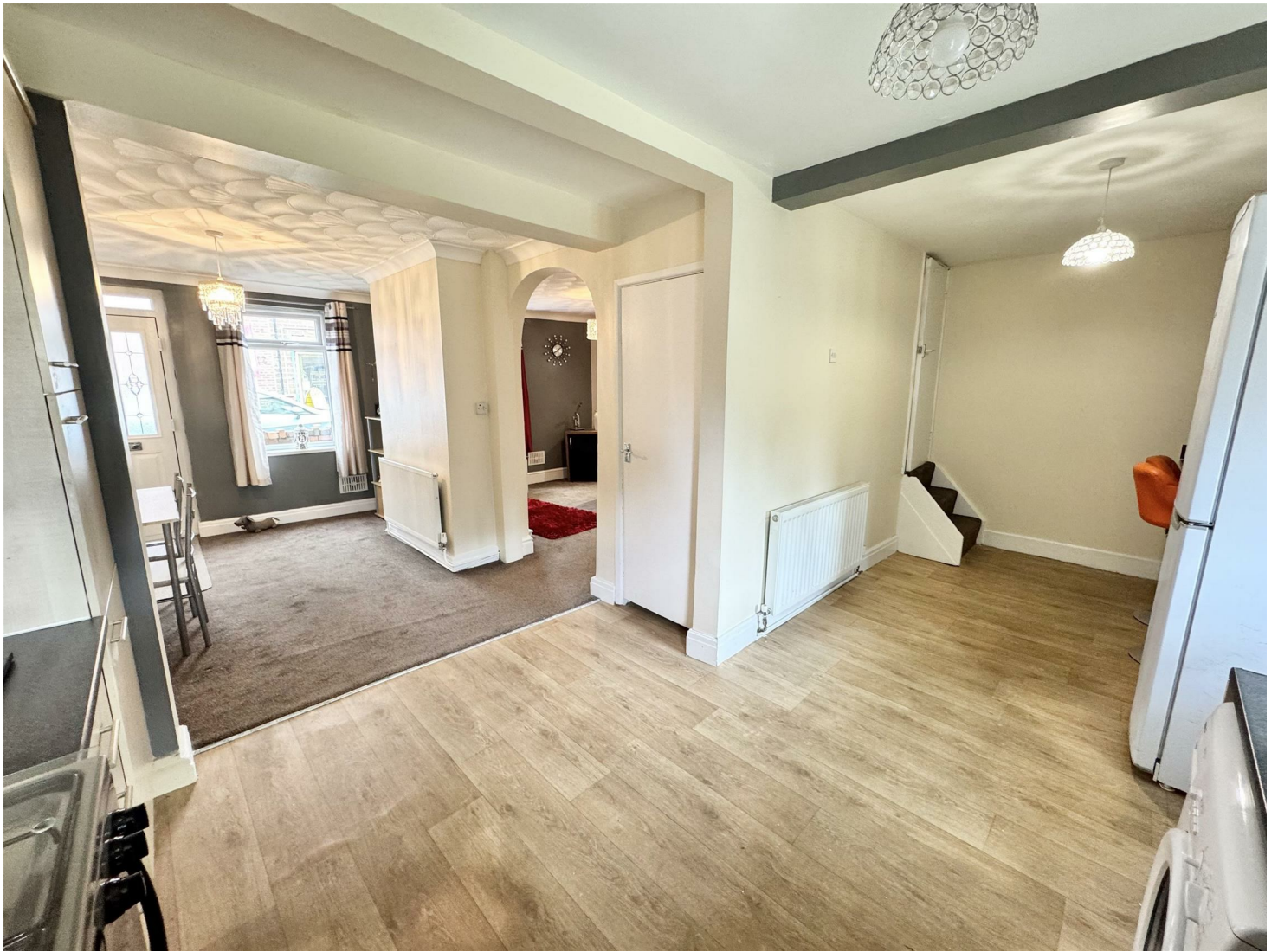
BREAKFAST ROOM 9'0" x 7'3"